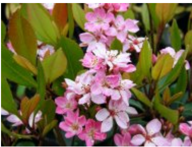
Rhaphiolepis indica 'Pink Clouds'

R. indica has toothed lanceolate leaves 2-3in long and chubby racemes of white flowers tinged with pink in the centre. R. umbellata has stout leathery oval leaves which have a felted grey down when young. The flowers are white and the fruits are blue-black in profusion with us after a hot summer which the birds seem not to like.