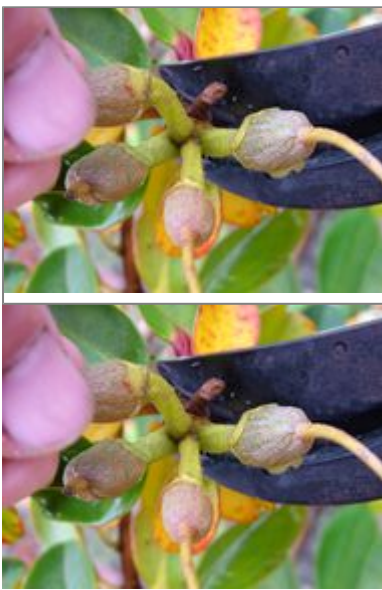
1. Removing the ripe seeds from the plant

In March or April when light levels increase you should consider sowing rhododendron seed. In the wild or even in your own garden you will find rhododendron seedlings germinating in damp mossy environments in the partial shade of other surrounding plants. Some growers therefore prefer to sow rhododendron seed into trays of moss collected from damp stony sites and re-rooted into a seed tray. However this is not strictly speaking necessary.