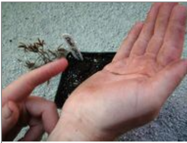
4. Planting the seeds