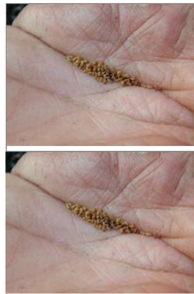
3. Rhododendron Seeds out of their pods