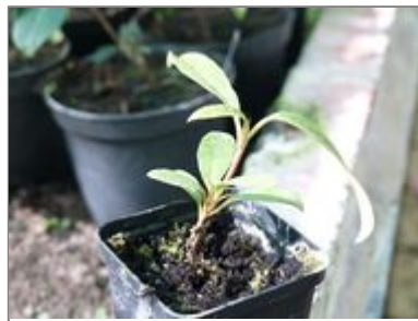
8. Rhododendron Seedling

Scatter or sprinkle the seed on to the surface of the pot and perhaps gently stir the surface with a nail. Do not bury the seed under the soil as surface germination is entirely natural in the wild.