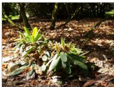
and weighed down by stones