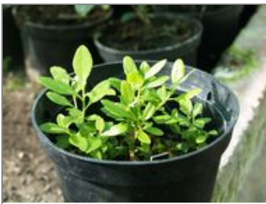
7. Rhododendron Seedling