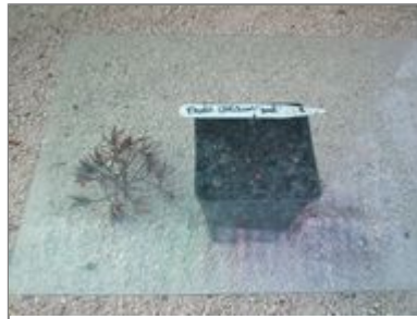
5. Waiting for germination