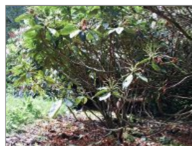
into the turned over soil.