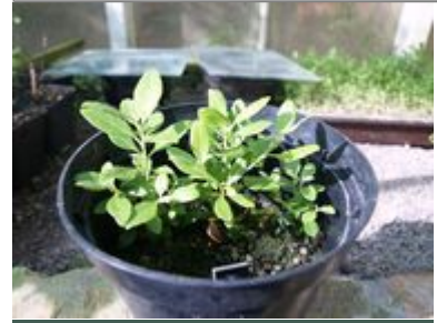
6. Rhododendron Seedling