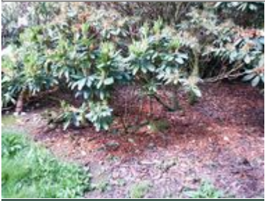
After 2/3 years