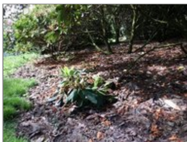
Rhododendron branches bent over