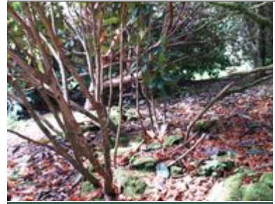
lifted and replanted.

This is a time consuming business which involves locating a branch on the plant which you wish to propagate which is near enough to the ground to be bent down to ground level without snapping it.