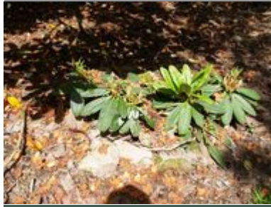
They are ready to be separated,