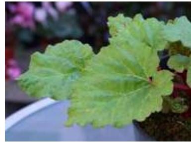
Rhubarb 'Timperley Early'