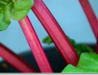
Rhubarb 'Timperley Early'

Burncoose Nurseries: Gwennap, Redruth, Cornwall TR16 6BJ