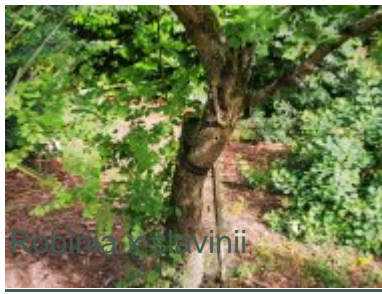
Robinia x slavonii