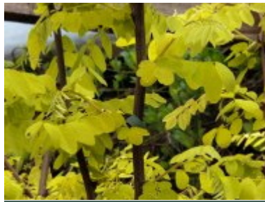
Robinia pseudoacacia 'Frisia'