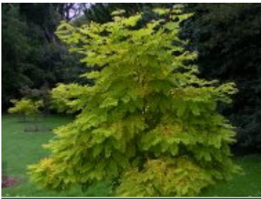
Robinia pseudoacacia 'Frisia'