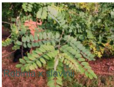
Robinia x slavonii