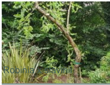
Robinia x slavonii