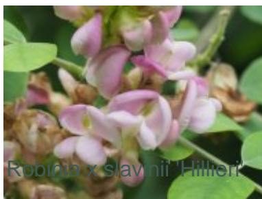
Robinia x slavonii 'Hillieri'