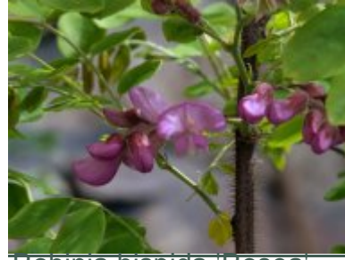
Robinia hispida 'Rosea'