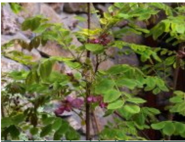
Robinia hispida 'Rosea'