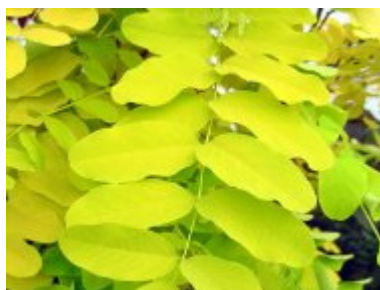
Robinia pseudoacacia 'Frisia'