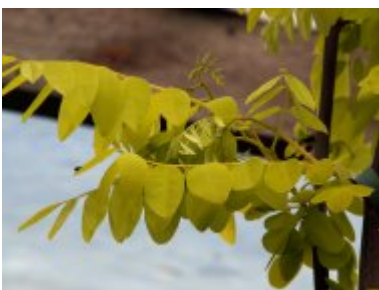
Robinia pseudoacacia 'Frisia'