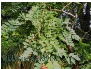
Robinia x slavonii