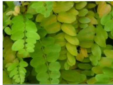
Robinia pseudoacacia 'Frisia'