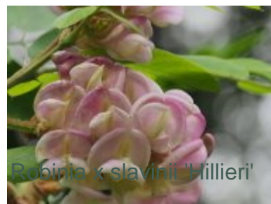
Robinia x slavonii 'Hillieri'