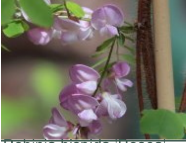
Robinia hispida 'Rosea'