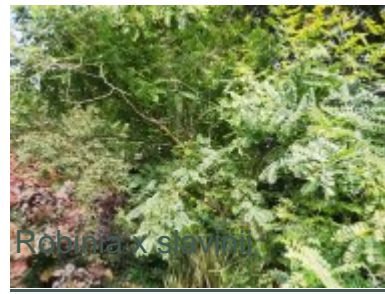
Robinia x slavonii