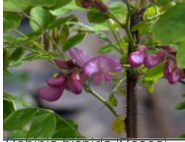
Robinia hispida 'Rosea'