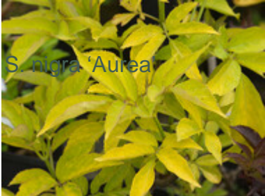
S. nigra 'Aurea'