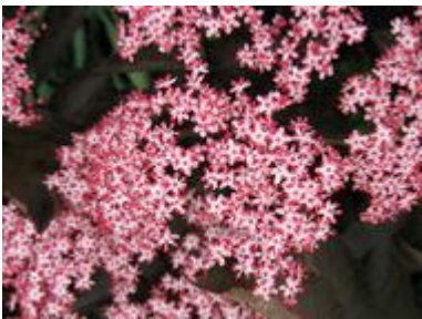
S. nigra 'Black Beauty'