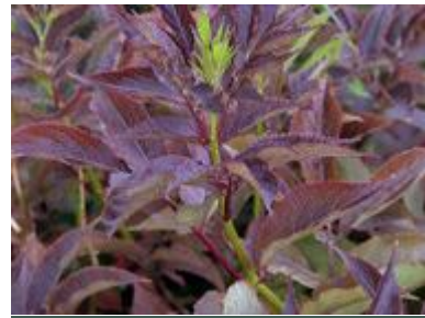
S. nigra 'Guincho Purple'