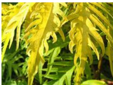
S. racemosa 'Sutherland Gold'