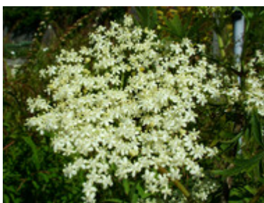
S. nigra laciniata