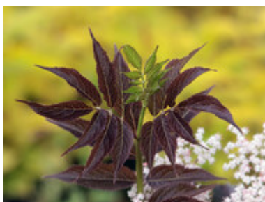
S. nigra 'Guincho Purple'