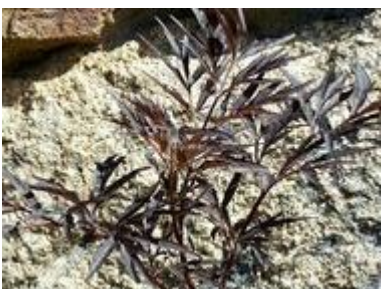
S. nigra 'Black Lace'