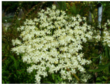
S. nigra laciniata