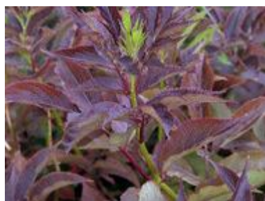
S. nigra 'Guincho Purple'