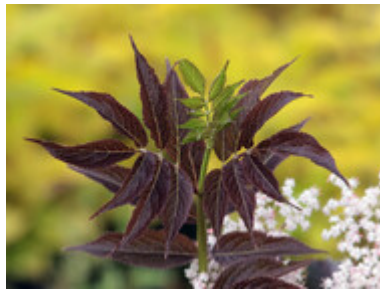
S. nigra 'Guincho Purple'