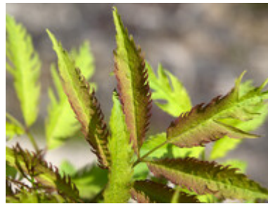
S. racemosa 'Sutherland Gold'