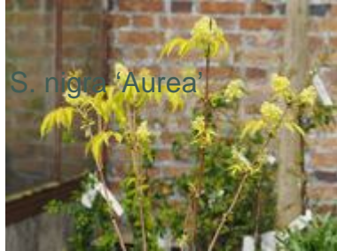
S. nigra 'Aurea'