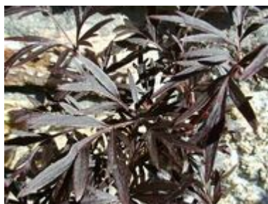
S. nigra 'Black Lace'