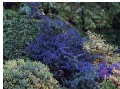
S. nigra 'Black Beauty'