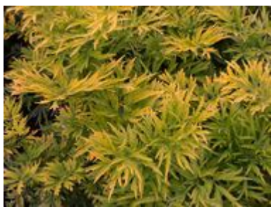
S. nigra 'Golden Tower'

S. nigra 'Golden Tower' has a narrow, upright habit and deeply cut bright yellow