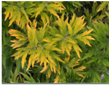
S. nigra 'Golden Tower'