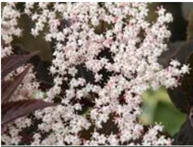
S. nigra 'Guincho Purple'