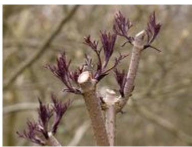
S. nigra laciniata