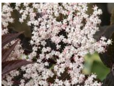
S. nigra 'Guincho Purple'