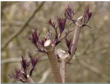
S. nigra laciniata