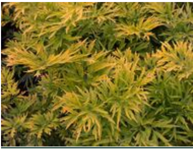
S. nigra 'Golden Tower'

S. nigra 'Golden Tower' has a narrow, upright habit and deeply cut bright yellow