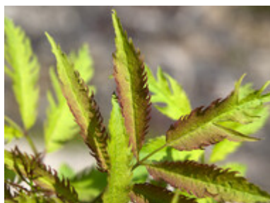
S. racemosa 'Sutherland Gold'

Burncoose Nurseries: Gwennap, Redruth, Cornwall TR16 6BJ