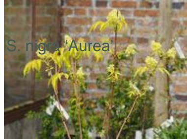
S. nigra 'Aurea'