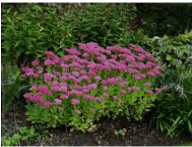
S. spectabile 'Autumn Joy'