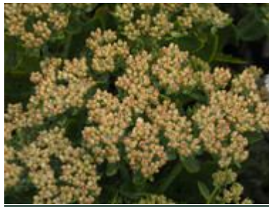
S. spectabile 'Autumn Joy'