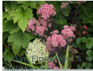
Sedum 'Frosty Morn' & 'Matrona'