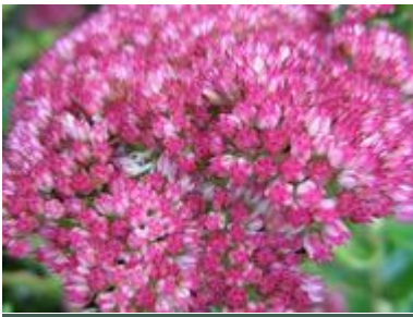
S. spectabile 'Autumn Joy'

S. spectabile 'Autumn Joy' has dark green leaves and flat corymbs of star-shaped flowers that are deep pink at first then turning pinkish-bronze and, finally, red.