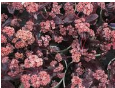
Sedum 'Purple Emperor'