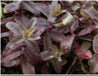
Sedum 'Purple Emperor'

S. spectabile 'Autumn Joy' has dark green leaves and flat corymbs of star-shaped flowers that are deep pink at first then turning pinkish-bronze and, finally, red.