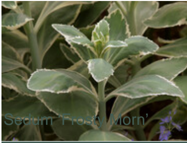
Sedum 'Frosty Morn'