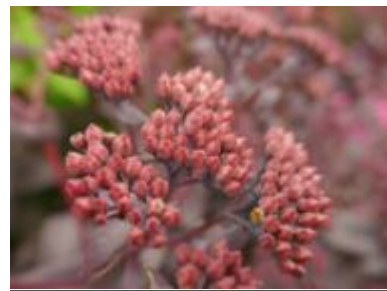
Sedum 'Purple Emperor'