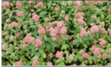
Sedum 'Red Cauli'