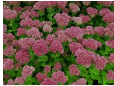
S. spectabile 'Autumn Joy'