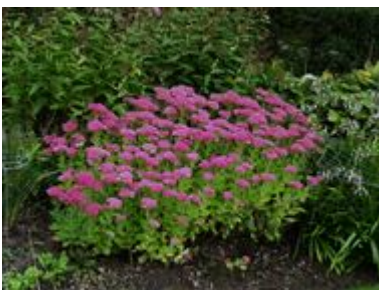
S. spectabile 'Autumn Joy'