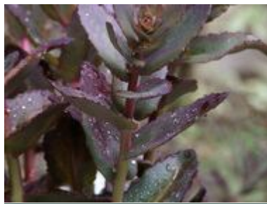
Sedum 'Purple Emperor'