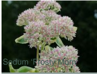
Sedum 'Frosty Morn'