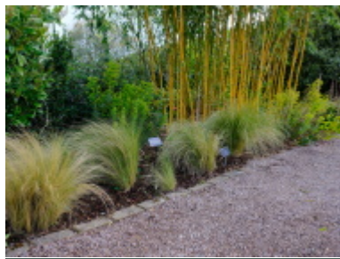
Stipa tenuissima & Phyllostachys aureosculata 'Spectabilis'