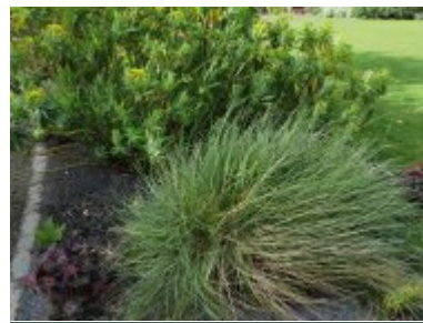
Stipa gigantea & Euphorbia pasteurii