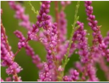
T. ramosissima 'Rosea'

Burncoose Nurseries: Gwennap, Redruth, Cornwall TR16 6BJ