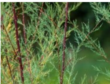
T. ramosissima 'Hulsdonk White'

We grow this plant from hardwood cuttings set in winter in a cold frame with a mix of sand and soil. Semi ripe cuttings in late summer are quite viable but you will get a larger plant more quickly from hardwood cuttings.