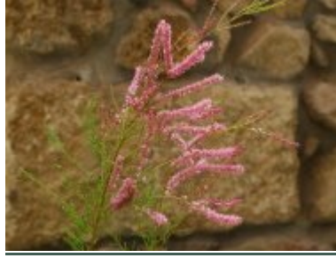
T. ramosissima 'Rosea'