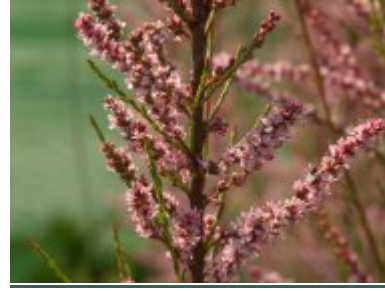
T. ramosissima 'Rosea'