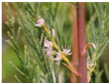
T. ramosissima 'Hulsdonk White'