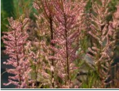
T. ramosissima 'Rosea'