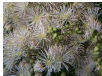
Thalictrum delavayi 'Album'