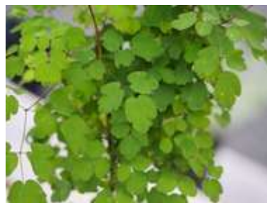
Thalictrum delavayi 'Hewitt's Double'