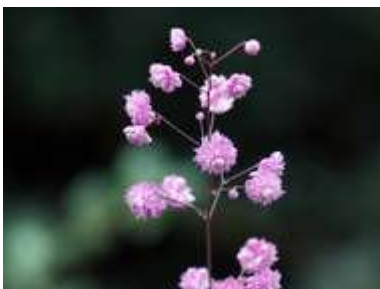
Thalictrum delavayi 'Hewitt's Double'