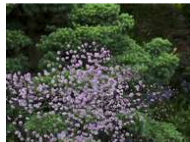
Thalictrum delavayi 'Hewitt's Double'