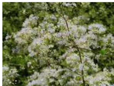
Thalictrum delavayi 'Album'