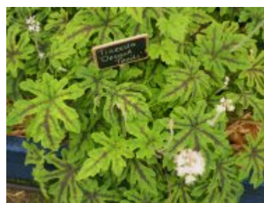
Tiareella 'Oregon Trail'