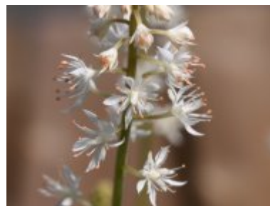
Tiareella 'Appalachian Trail'