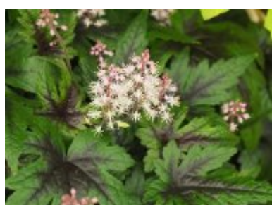
Tiareella 'Sugar and Spice'