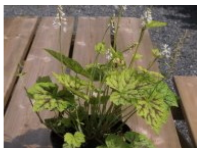
Tiareella 'Appalachian Trail'