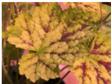
Tiareella 'Appalachian Trail'