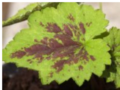
Tiarella 'Appalachian Trail'

These plants are remarkably easy to lift and divide to create more plants. T. cordifolia stolons can be removed at any time for growing on and transplanting without interfering with the main clump at all.