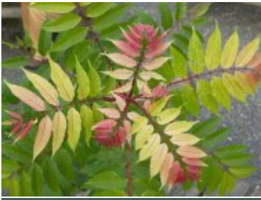
Toona sinensis 'Flamingo'

Burncoose Nurseries: Gwennap, Redruth, Cornwall TR16 6BJ