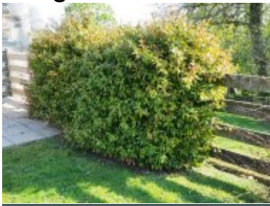
T. jasminoides growing on a fence

In very cold areas these plants also make excellent greenhouse climbers. Cuttings of fresher new growth in mid summer are easy to root.