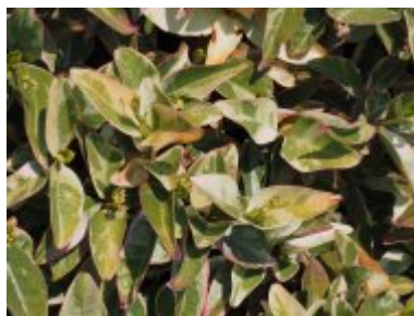
T. jasminoides 'Tricolor' growing on fence