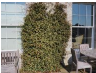
T. jasminoides 'Tricolor' growing on fence