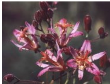
Tricyrtis hirta 'Taiwan Adbane'