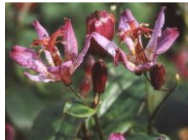
Tricyrtis hirta 'Taiwan Adbane'