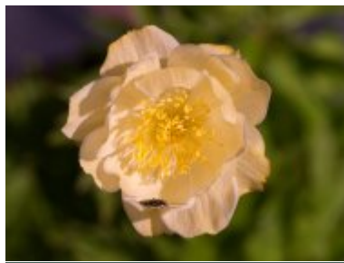
Trollius x cultorum 'New Moon'