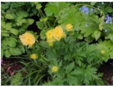
Trollius x cultorum 'New Moon'

T. x cultorum 'New Moon' is smaller growing with a profusion of delicate pale-yellow flowers.