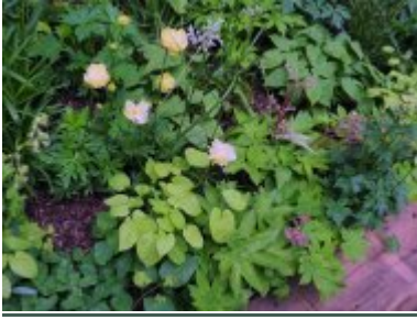
Trollius x cultorum 'New Moon'