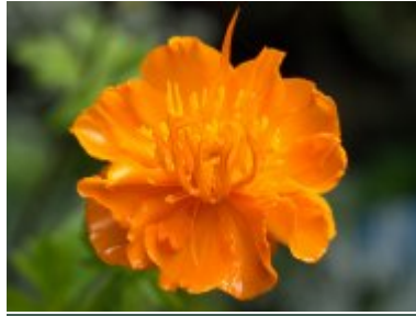
Trollius chinensis 'Golden Queen'

Burncoose Nurseries: Gwennap, Redruth, Cornwall TR16 6BJ