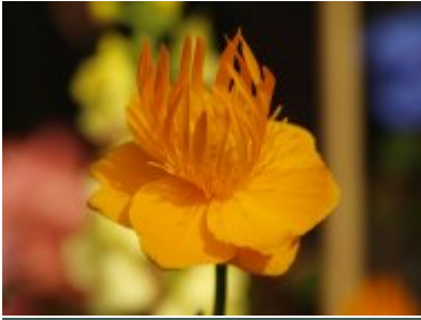
Trollius chinensis 'Golden Queen'