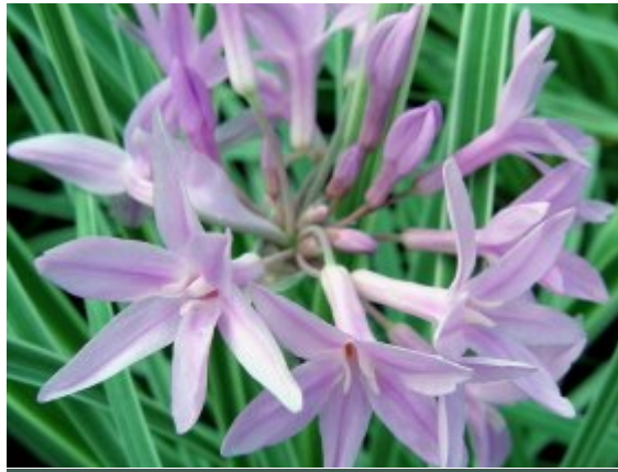
TULBAGHIA violacea 'silver lace'