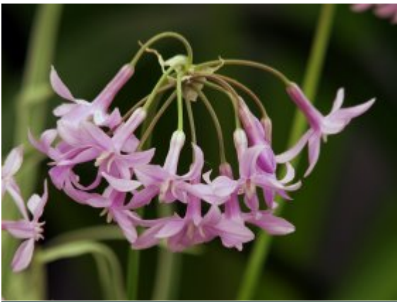
TULBAGHIA violacea 'silver lace'