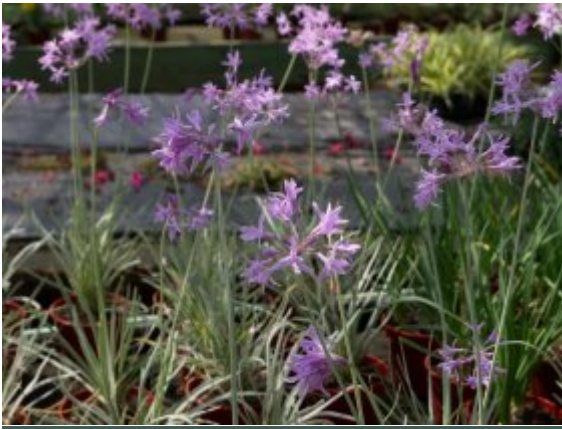
TULBAGHIA violacea 'silver lace'

under threat from these pests stand the pots outside for a couple of weeks and the problem will reduce.