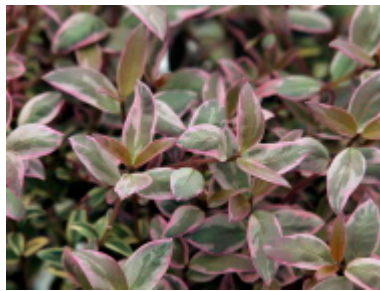
U. molinae 'Flambeau'