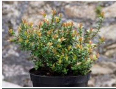
U. molinae 'Butterball'