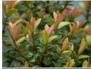
U. molinae 'Butterball'