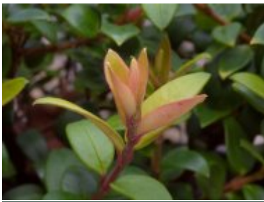
U. molinae 'Butterball'