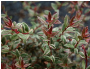
U. molinae 'Flambeau'