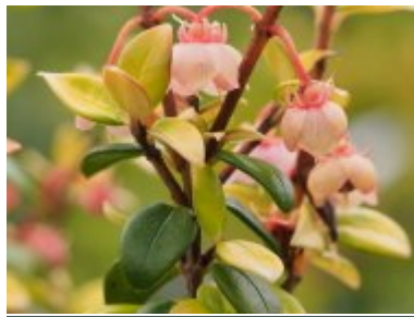
U. molinae 'Butterball'