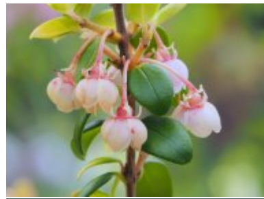
U. molinae 'Butterball'