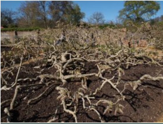
Wisteria Savill Garden April

View this video on Youtube here https://www.youtube.com/Vu9QTwf6JoM?rel=0