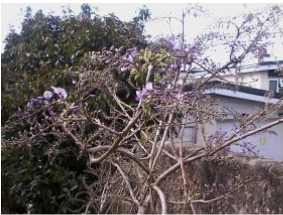
Starting to flower in spring after pruning in winter