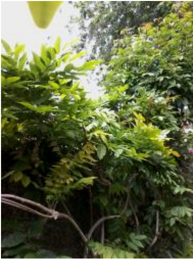
July after pruning

View this video on Youtube here https://www.youtube.com/ZuV5u5zh8go