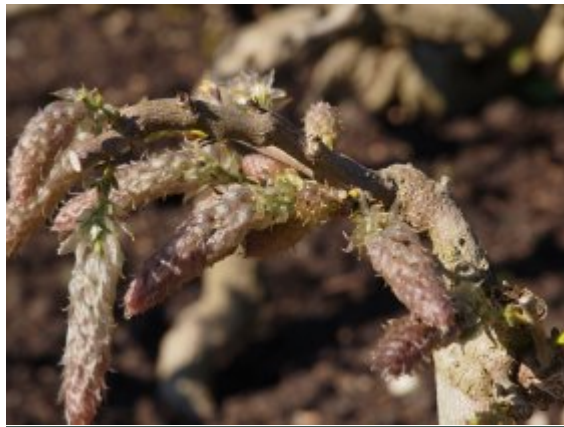
Wisteria 3 or 4 buds