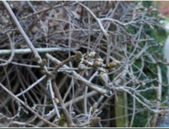
Wisteria 3 or 4 buds