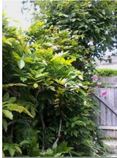
July before pruning