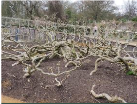
Wisteria Savill Garden March