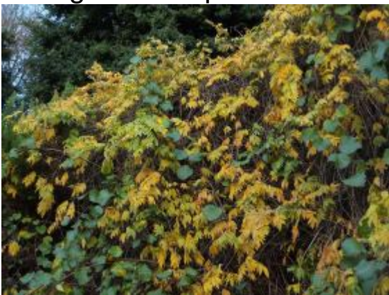
November before pruning

This winter pruning may be easier but you may still need a ladder! At this time of the year you are aiming to cut back the newer shoots to just three /four buds. In effect the last year's growth needs to be cut back to 3-4". You should aim to remove any growth outside the main framework of your trellis or wiring. However, with this second seasonal pruning, you are ensuring the best possible flower production from your plant.