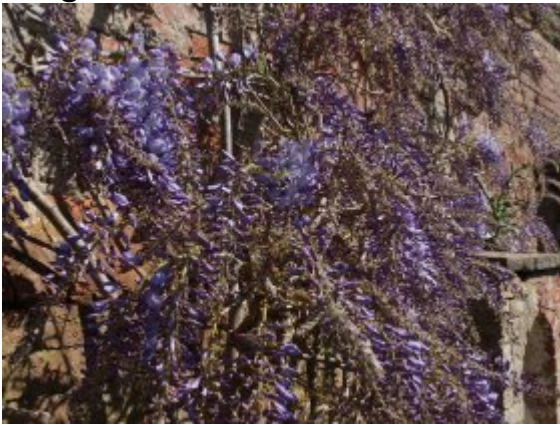
Wisteria at Penrice Castle

The shoots and stems on Japanese wisteria twine clockwise, the flowers appear at the same time as the foliage develops and are generally 12-18" long