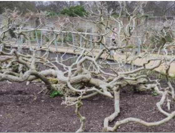
Wisteria Savill Garden March