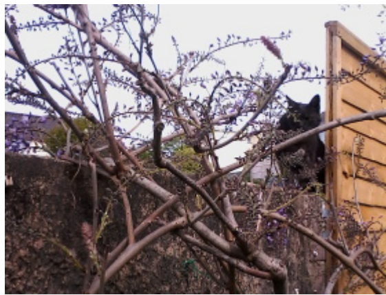
Starting to flower in spring after pruning in winter

In the main, do not! In the early years some potash or bone meal feed may well help to get the plant growing on satisfactorily but use this sparsely.