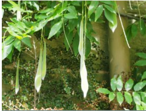
Setting seed if left un-pruned