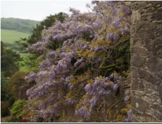
Wisteria at Caerhays Castle