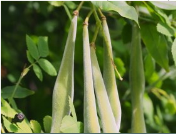
Setting seed if left un-pruned

There is, as ever, one other potential reason why your plant may not be flowering. Wisteria cultivars are usually grafted onto a seedling Wisteria sinensis rootstock. If the graft dies, or even if it does not, there may be growth from at or below the ground level from the rootstock itself. In this instance you will need to remove all growth from the rootstock or dig the plant out and start again if the grafted portion has died or been smothered.