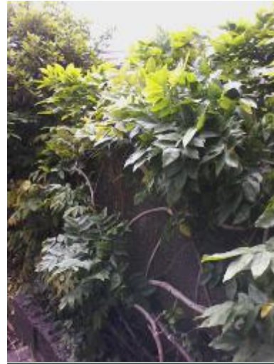
July after pruning