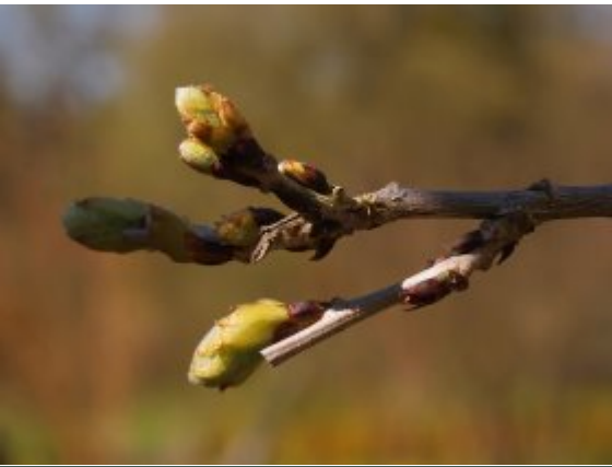
Wisteria 3 or 4 buds