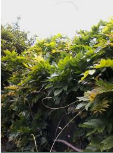
July before pruning

Immediately after flowering, when the spurs and tendrils of new growth are growing away exponentially, is the time to ensure good flowering next season. You are aiming not just to train and control the plant as and where you want it to grow but, more crucially, to avoid the plant wasting energy on new growth shoots which will not produce any flowers next year. So prune out the soft and whippy new growth to about 6". Leave unpruned the growths needed to fill the trellis or wires in the shape you want. There may well be a lot of new growth to remove and this includes growth and vigorous shoots from the base of the plant or even from root suckers at ground level where the roots are forced above the soil level and exposed to light. This is common in older wisteria.