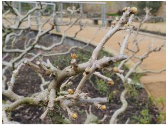
Wisteria Savill Garden March