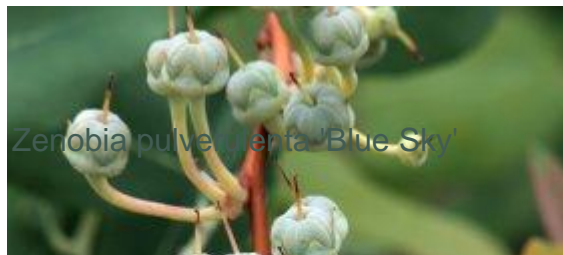
Zenobia pulverulenta 'Blue Sky'