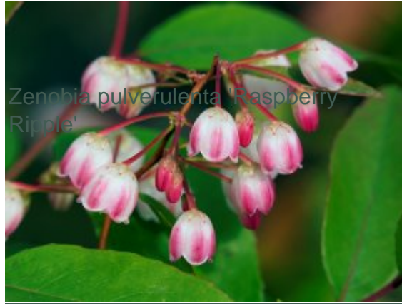
Zenobia pulverulenta 'Raspberry Ripple'