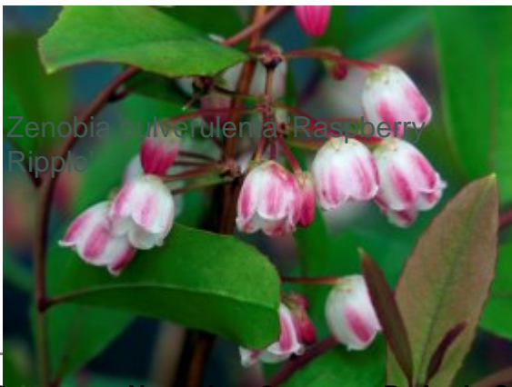
Zenobia pulverulenta 'Raspberry Ripple'

Burncoose Nurseries: Gwennap, Redruth, Cornwall TR16 6BJ