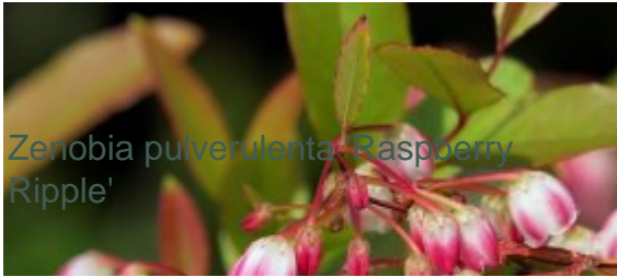
Zenobia pulverulenta 'Raspberry Ripple'