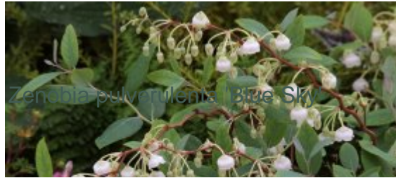
Zenobia pulverulenta 'Blue Sky'