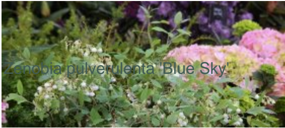
Zenobia pulverulenta 'Blue Sky'