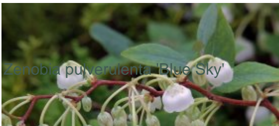
Zenobia pulverulenta 'Blue Sky'