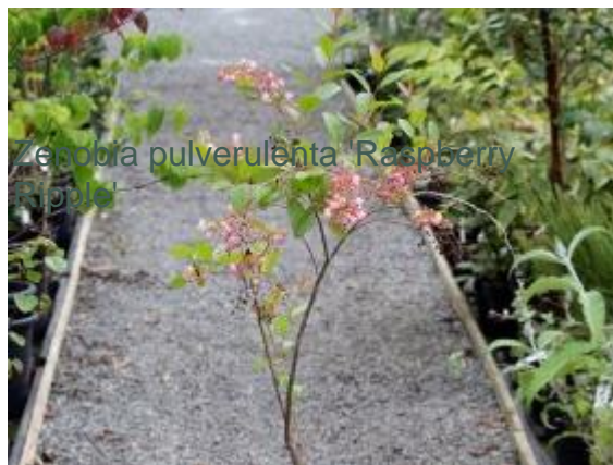
Zenobia pulverulenta 'Raspberry Ripple'