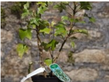
x Fatshedera lizei 'Variegata'