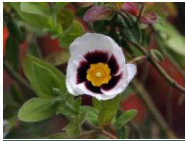
x Halimocistus wintonensis