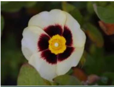
x Halimocistus wintonensis 'Merrist Wood Cream'