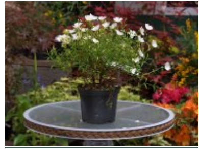
x Halimocistus sahuicii