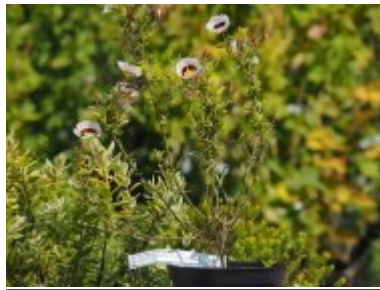
x Halimocistus wintonensis