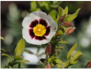
x Halimocistus wintonensis