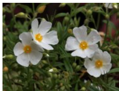
x Halimiocistus sahucii