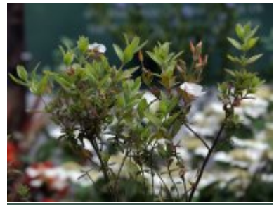
x Halimocistus wintonensis