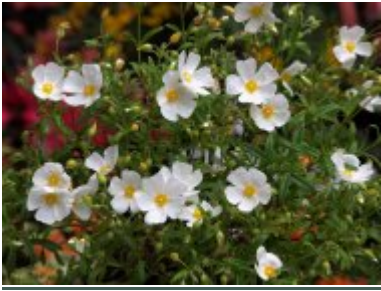
x Halimocistus sahuicii