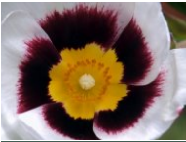
x Halimocistus wintonensis