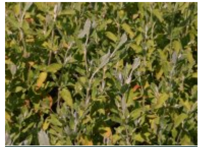
x Halimocistus wintonensis 'Merrist Wood Cream'