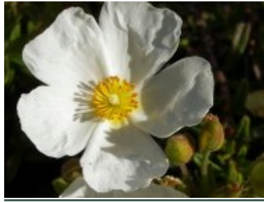
x Halimocistus sahuicii