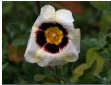
x Halimocistus wintonensis 'Merrist Wood Cream'