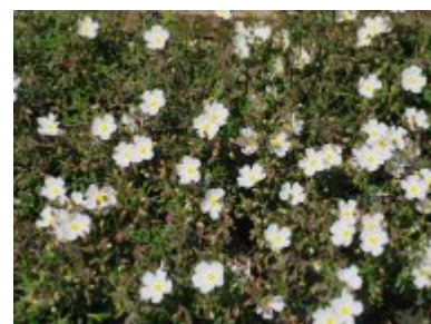
x Halimiocistus sahucii