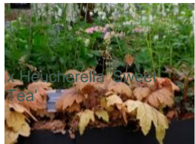
x Heucherella 'Sweet Tea'