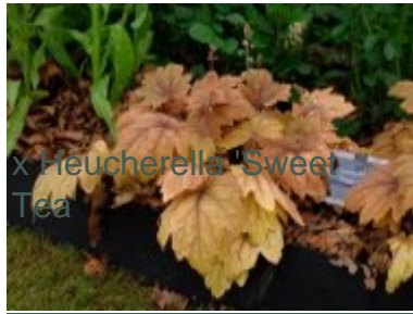
x Heuchera 'Sweet Tea'