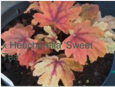
x Heuchera 'Sweet Tea'