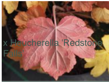
x Heucherella 'Redstone Falls'