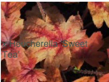
x Heucherella 'Sweet Tea'