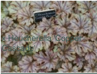
x Heucherella 'Copper Cascade'