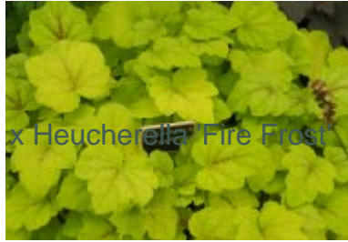
x Heucherella 'Fire Frost'