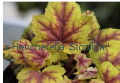
x Heucherella 'Stoplight'