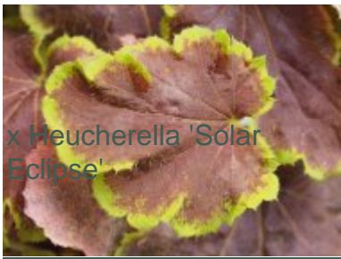
x Heucherella 'Solar Eclipse'