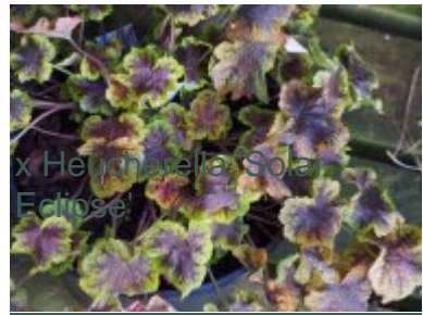
x Heucherella 'Solar Eclipse'