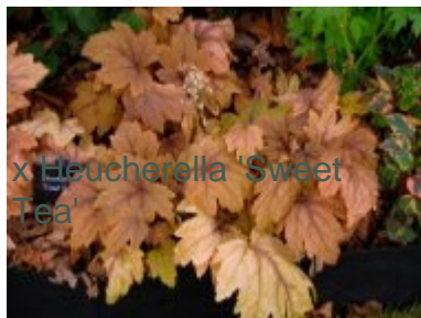
x Heucherella 'Sweet Tea'