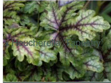
x Heuchera 'Tapestry'