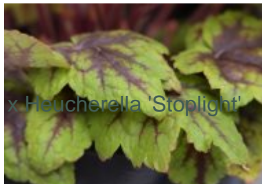
x Heucherella 'Stoplight'