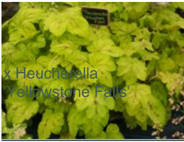
x Heuchera 'Yellowstone Falls'

Burncoose Nurseries: Gwennap, Redruth, Cornwall TR16 6BJ